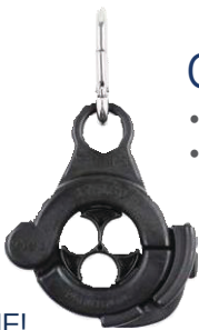
PHI17180 QWIK-CLAMP™ with insert $16.85