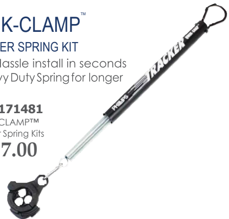
PHI171481 QWIK-CLAMP™ Tracker Spring Kits $37.00