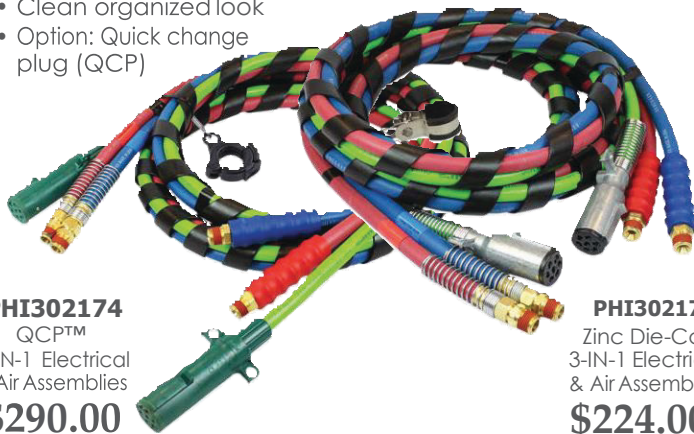
PHI302174 QCP™ 3-IN-1 Electrical & Air Assemblies $290.00