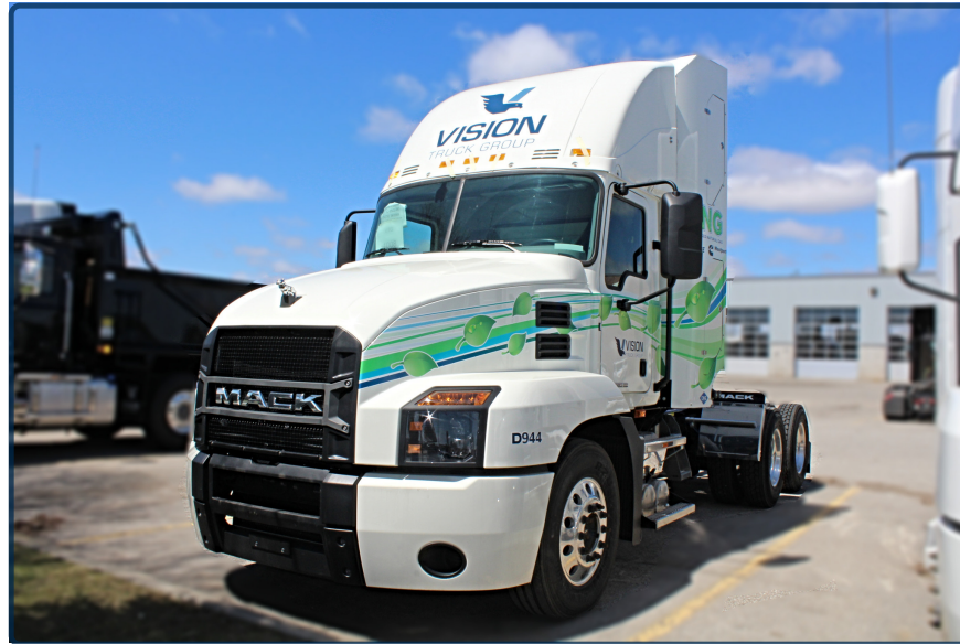
2019 Mack Anthem Tandem Axle Daycab Tractor Powered by Compressed Natural Gas

GVW: 80,000 LBS WHEEL BASE: 197" ENGINE: Cummins MODEL: ISX126-NZ HORSEPOWER: 400 ENGINE BRAKE: Yes REAR AXLE CAPACITY: 40,000 LBS FRONT AXLE CAPACITY: 12,000 LBS TRANSMISSION: AUTOMATED FUEL: Compressed Natural Gas CAPACITY: 175 DGE