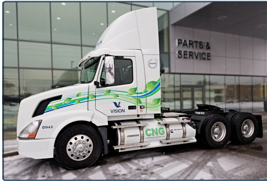
2017 Volvo VNL Tandem Axle Daycab Tractor Powered by Compressed Natural Gas

GVW: 80,000 LBS WHEEL BASE: 189" ENGINE: Cummins Westport MODEL: ISX12G HORSEPOWER: 400 ENGINE BRAKE: Yes REAR AXLE CAPACITY: 40,000 LBS FRONT AXLE CAPACITY: 12,000 LBS TRANSMISSION: MANUAL FUEL: Compressed Natural Gas CAPACITY: Diesel Gallon Equivalent 135